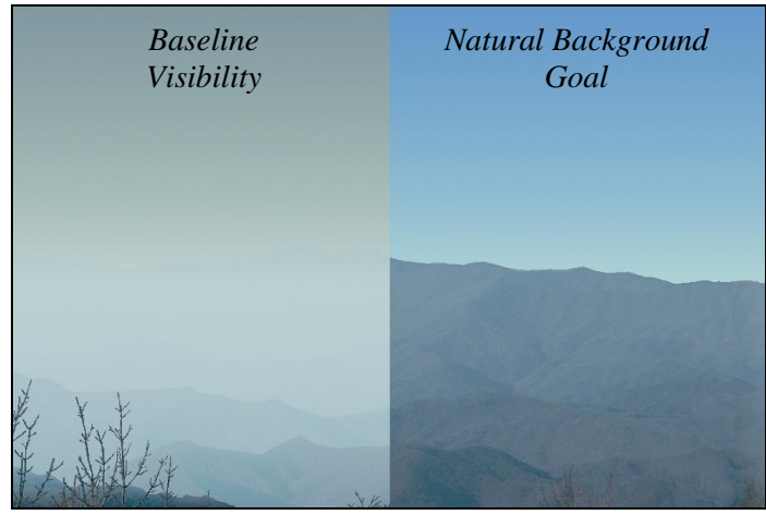
Figure 1: Baseline vs. Natural Background Visibility at Joyce Kilmer-Slickrock Wilderness Area in Tennessee

One of the most noticeable forms of air pollution is haze, a veil of smog-like pollution that can blur the view of many urban and rural areas. As part of the Clean Air Act, Congress has established a goal to prevent future and remedy existing visibility impairment in 156 protected national parks and wildernesses, known as Class I Areas. Federal rules require state and federal agencies to work together to improve visibility in these areas so that natural background conditions are achieved by the year 2064. Figure 1 shows a visual representation using the model WinHaze of how that improvement would appear at the Joyce Kilmer-Slickrock Wilderness Area.