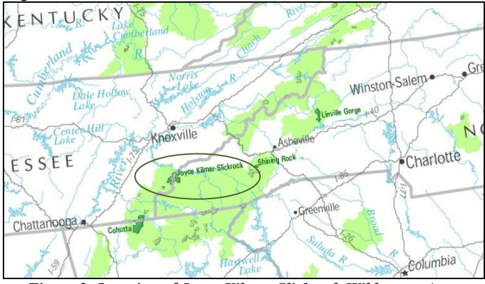
Figure 2: Location of Joyce Kilmer-Slickrock Wilderness Area

Joyce Kilmer-Slickrock Wilderness Area is a protected Class I Area located in the Nantahala National Forests on the border of Tennessee and North Carolina, as shown in Figure 2.