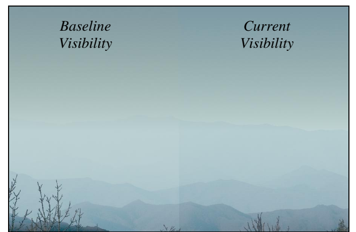
Figure 5: Computer Generated Approximation of the Visibility Improvement at Joyce Kilmer-Slickrock Wilderness Area

SVR improved approximately 20% from 2000 to 2009 at Great Smoky Mountains National Park and Joyce Kilmer-Slickrock Wilderness. Figure 5 gives an idea of what this improvement looks like.